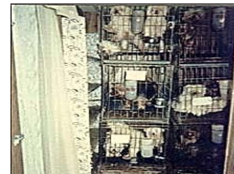
Cage.. after cage...after cage.. after cage ...after.....

We encourage members to become aware of how these issues affect animals in our state, and to contact your legislators.