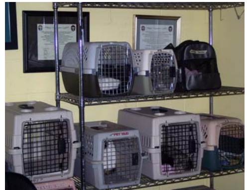
The waiting room at SpayOK was packed!

OAA extends a warm thank you to our partners which include SpayOK, Paw